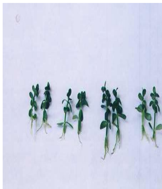
Fig. 2: Effect of BAP and IAA on root of formation of nodal explants