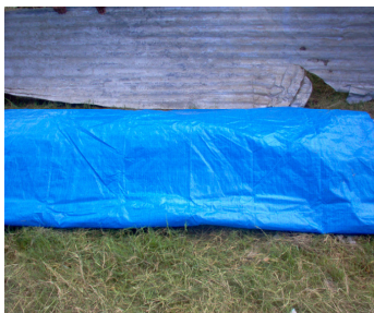
Fig. 2 Biodung composting unit