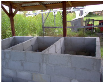
Fig. 1 Vermiculture tanks

Biodung composting units were set up (in triplicate), by using the combination of water hyacinth and grasses (Fig 2). The biodung composting were turned after 15 days and were transferred to respective vermitech units after total time period of 30 days for further processing and vermicomposting. During march, 2007, vermicompost from the three tanks was harvested (Fig 3).