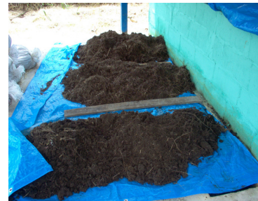
Fig. 3 Vermicompost at harvest